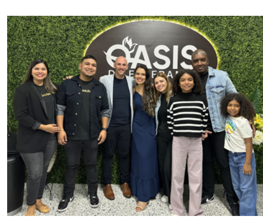
Pastors/friends from Cocle.