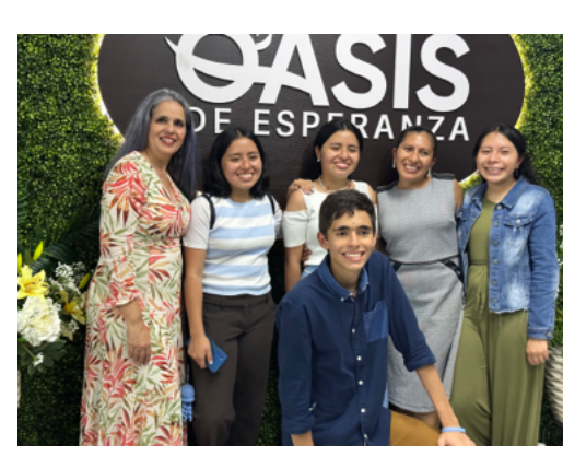
Photos from the grand opening, a joyous day.