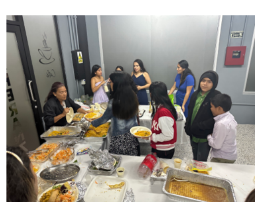
Time of fellowship and supper together.